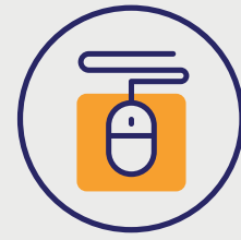
LEADERSHIP IN THE DIGITAL AGE