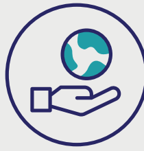
MANAGING EQUALITY, DIVERSITY AND INCLUSION