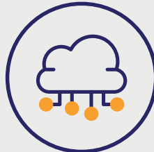
DATA DRIVEN DECISION MAKING